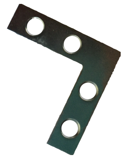
Flat Corner Bracket

Add glue to the back about 1/4" from edge of frame. Carefully lay MDF board on frame with chalkboard face down.